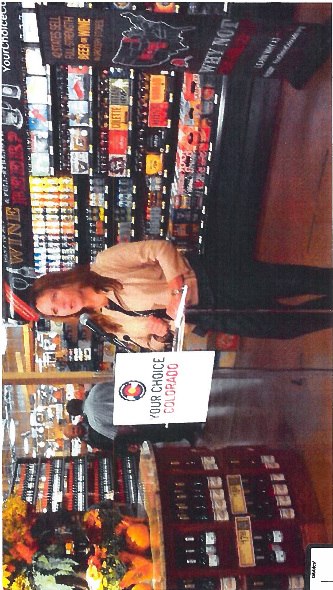
tabbles EXHIBIT B